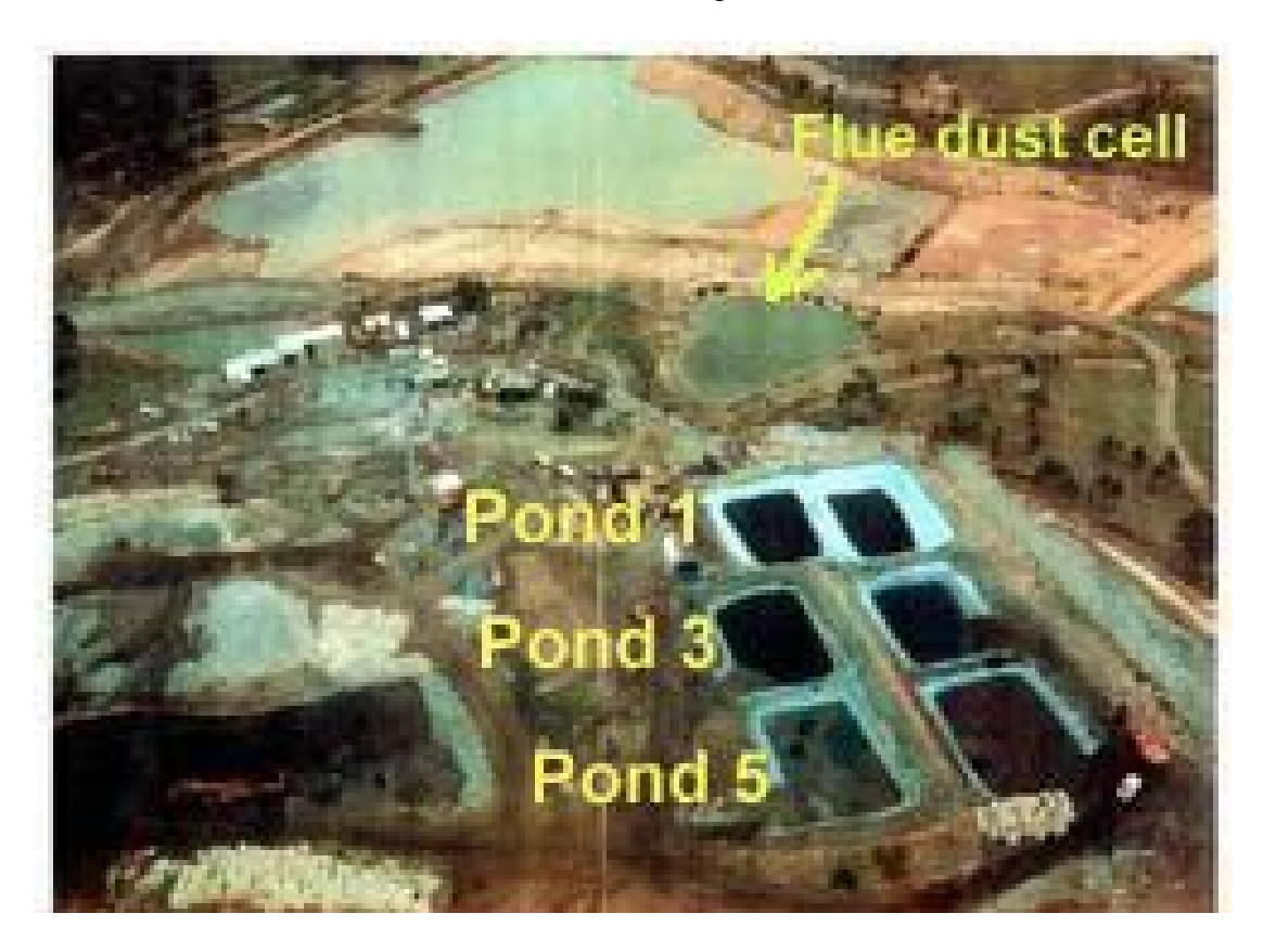
Figure 2 – Location of Flue Dust Cell

The location of the cell on the site is shown in Figure 2.