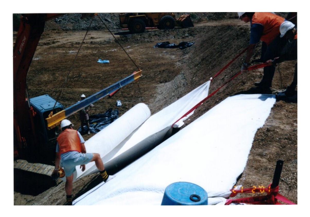
\begin{array}{c} \textbf{Photo 1-Installation of ELCOSEAL \ GCL \ on \ the \ upstream \ tailings \ dam \ \\ \textbf{face} \end{array}