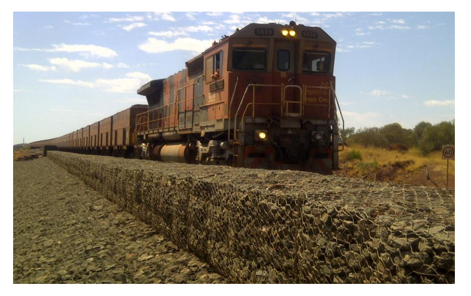
The Gabion causeway protection – March 2013

Approximately 1,800m<sup>3</sup> of Gabions, 10,500m<sup>2</sup> of 500mm deep Gabion Mattresses and 12,000m<sup>2</sup> of woven Terramesh soil reinforcement was installed. All woven mesh products specified in the project documents were Galmac (95%Zinc 5%Aluminium Alloy) + PVC coated to the most stringent national and international standards. A valid British Board of Agrément (BBA) certificate was provided as part of the QA documentation.