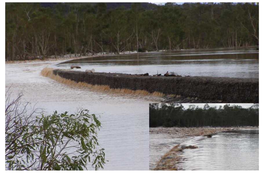
The 980m long Gabion low level causeway being tested during a flood event – March 2009 There was no maintenance required to the structure once the flood waters had receded.

Approximately 1,800m<sup>3</sup> of Gabions, 10,500m<sup>2</sup> of 500mm deep Gabion Mattresses and 12,000m<sup>2</sup> of woven Terramesh soil reinforcement was installed. All woven mesh products specified in the project documents were Galmac (95%Zinc 5%Aluminium Alloy) + PVC coated to the most stringent national and international standards. A valid British Board of Agrément (BBA) certificate was provided as part of the QA documentation.