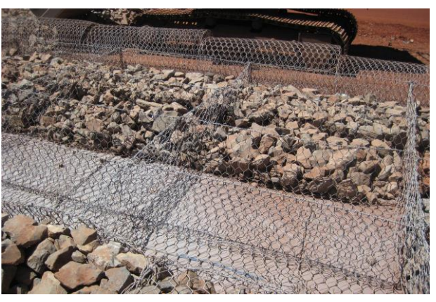
Mechanical means used to assist in the rock packing process

The project tender technical documentation stated that the Gabion work shall only be undertaken by specialist installers, approved and certified by Geofabrics Australasia and highly experienced in this work. A sample group of Gabions were also required to be constructed on site to be used for quality control purposes throughout the duration of the Gabion works. Only once these units had been inspected by relevant parties (including the Gabion manufacturer's representative), and deemed to have been constructed to the acceptable standard, could the main gabion works be undertaken.